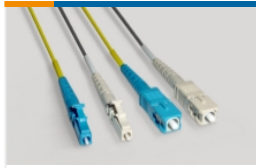
Fiber Optic Patch Cable Assemblies(8)