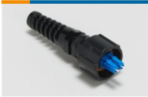
ODVA LC Connectors(3)