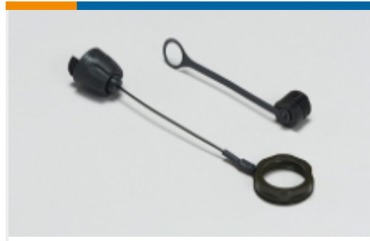
Fiber Connector Covers & Caps(1)